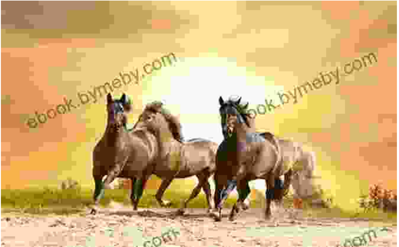
Dynamic horse anatomy in motion for realistic animal depictions.