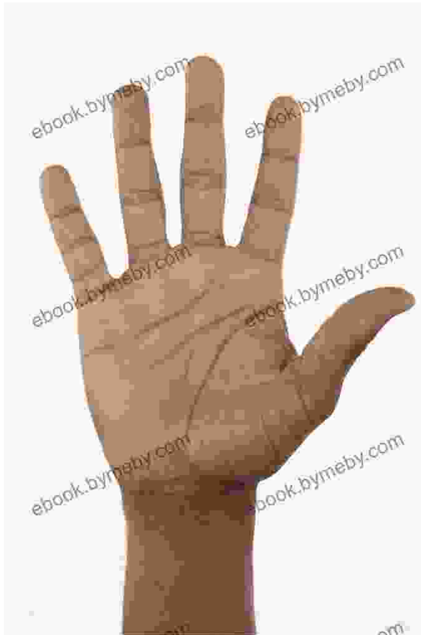
Detailed image of hand anatomy for precise rendering.